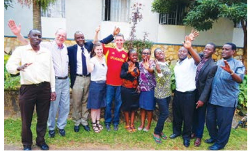
Above and below: KEST staff and faculty team.